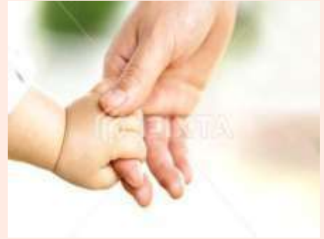
Personality of the Month

M. Gandhi was nominated for Nobel Peace Prize in 1937, 1938, 1939, and 1947. He was nominated again in 1948 and it was sure that he would get the prize this time. But few days before the final announcement of the Nobel Peace Prize, he was assassinated by N.R. Godse.