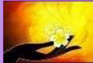
Personality of the Month

The Nobel Prize in Physiology or Medicine in 1968 was awarded jointly to Robert W. Holley, Har Gobind Khorana and Marshall W. Nirenberg "for their interpretation of the genetic code and its function in protein synthesis."